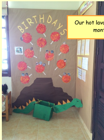
Our hot lava shooting out to show which month our birthdays are!