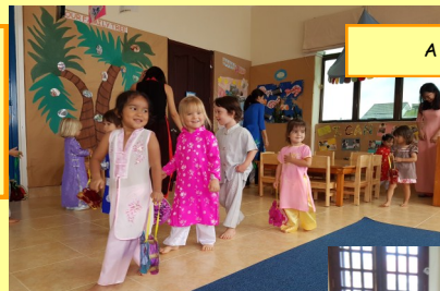
A wonderful parade!