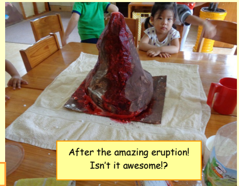
After the amazing eruption! Isn't it awesome!?