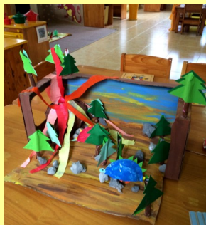
The finished product! Everybody did such a great job!