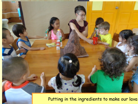
Putting in the ingredients to make our lava